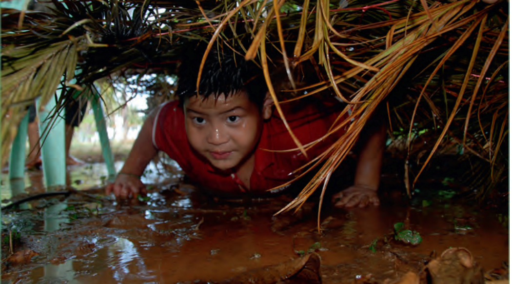
Photographer: Arne Hustrulid - Thailand