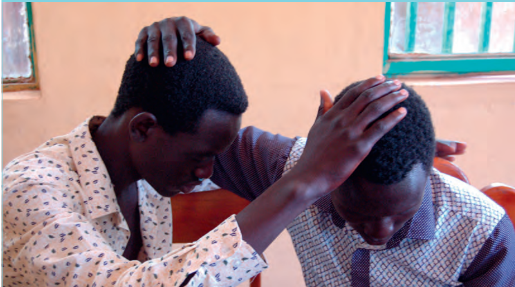
Photographer: Mparany Rakotondrainy, Ethiopia

The Lord God says, «I will make you into a great nation, and I will bless you ; I will make your name great, and you will be a blessing. » (Genesis 12:2-3). We've been blessed to be a blessing. The BLESS-lifestyle is meant to give you an easy, natural way to talk to your friends, neighbors and relatives about having a relationship with Christ.